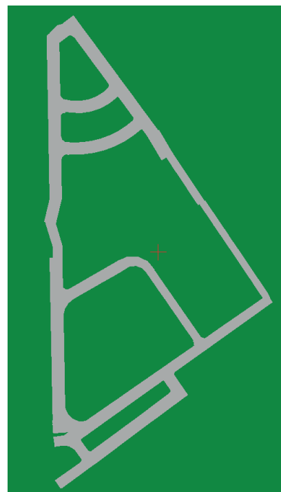
Fig. 4 The road network in OpenDRIVE ODR Viewer