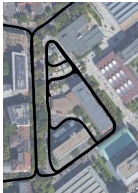
Fig. 1 The sample area surveyed by Leica Pegasus Two mobile mapping system. The black line is a logged trajectory

The OpenStandard family is a collection of environment-related data support in vehicular simulations. The flagship of the family is OpenDRIVE, developed to represent the road geometry and its environment. OpenCRG [15] contains an abbreviation for Curved Regular Grid, which is the macroscopic description for road surface in the form of a matrix-like notation [10, 12, 16, 17]. The application of OpenSCENARIO [18] can introduce traffic flow.