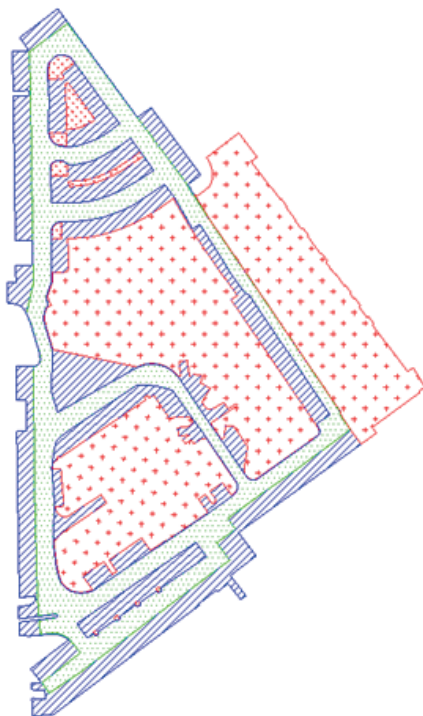
Fig. 3 Land use map after manual evaluation of the cleaned point cloud

The elaborated technology can be evaluated only through the derived products, now via the OpenDRIVE road model. As the aim was to represent the campus in automotive simulators, the best testing was available in these software environments. The most straightforward test was the Matlab simulator (Driving Scenario Designer) because it supports the OpenDRIVE scenario map definition. The imported campus model can be extended by moving vehicles – even equipped with different sensors like cameras or radars. These sensors can be placed on various vehicle parts: in the front panel, rooftop, side panel, etc. Thanks to this opportunity, a test can be executed, where the sensors' visibility or environmental sensing can be modeled. To a higher quality simulation scenario, we have added a car (it is represented by a blue box), defined a trajectory composed from straight and curved road segments, as well as one left turn. A camera was placed on top of the vehicle's roof, directing forward. The simulation